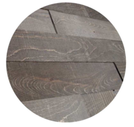
DESIGN YOUR OWN STYLE Create stunning effects by combining colors