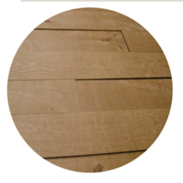
CREATE AN AUTHENTIC EFFECT Each box contains two different thicknesses