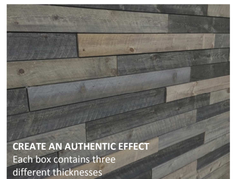
CREATE AN AUTHENTIC EFFECT Each box contains three different thicknesses